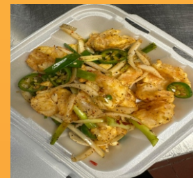
Salt & Pepper Shrimp