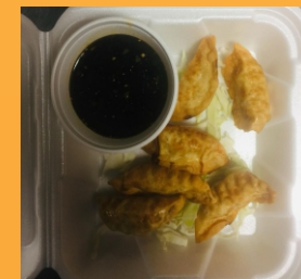
Fried Meat Wontons (6)