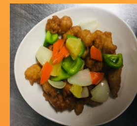
Sweet & Sor Chicken