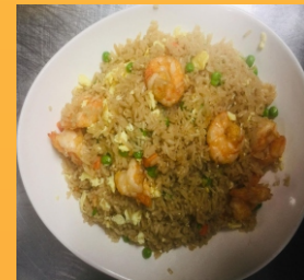
Shrimp Fried Rice