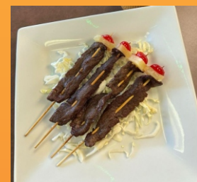
Cho Cho Beef